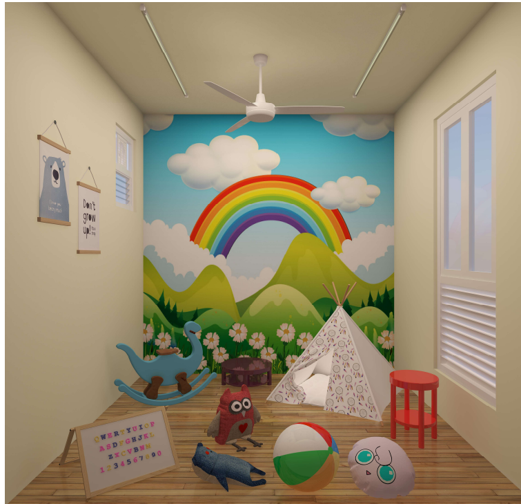
POST COVID CONVERSION TO PLAY ROOMS OF PICCU

OPD EXAMINATION MODULE PROCEDURE ROOM MODULE INPATIENT GENERAL WARD INPATIENT DELUX ROOM MODULE PHARMACY MODULE